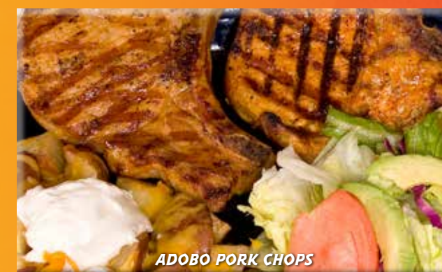
ADOBÓ PORK CHOPS

Tender grilled chicken breast fillet topped with cream and cheddar cheeses and pico de gallo. Served with rice and beans. 14.49 • Add 1.99 for bacon