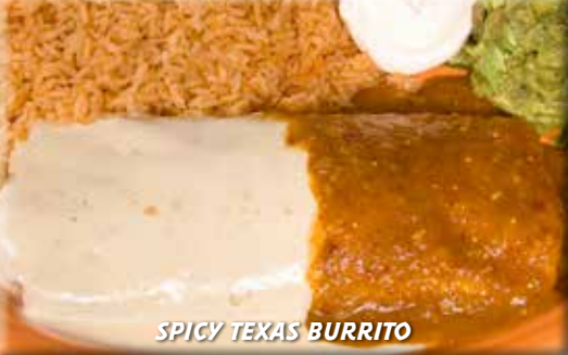
SPICY TEXAS BURRITO