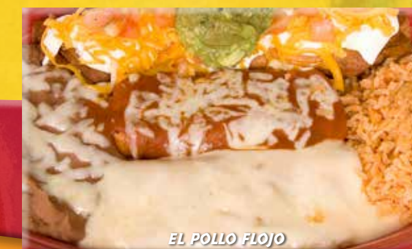
EL POLLO FLOJO

A platter filled with a mini chicken flauta, mini chicken chimichanga, and an enchilada suisa. Garnished with guacamole and sour cream. 20.99