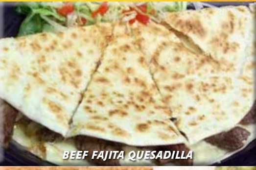
BEEF FAJITA QUESADILLA